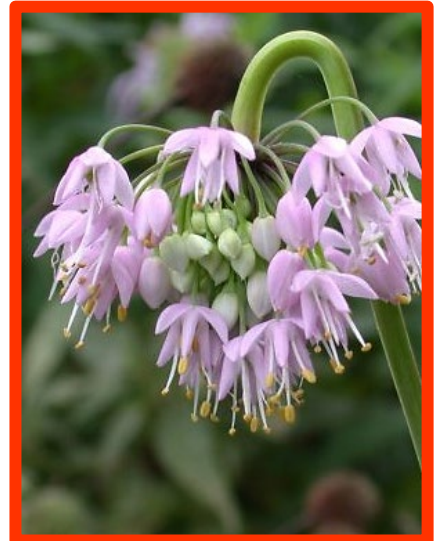
Nodding onion ( Allium cernuum )