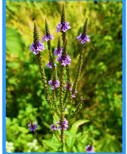
Blue vervain ( Verbena hastata )