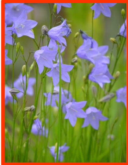
Harebell ( Campanula rotundifolia )