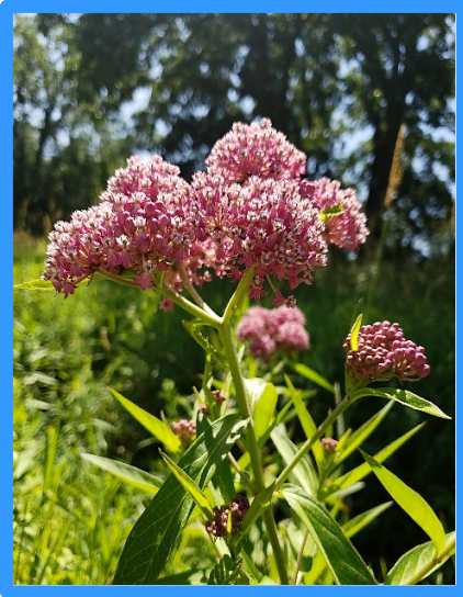
Swamp milkweed ( Asclepias incarnata )