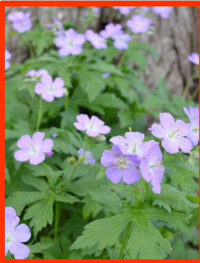
Wild geranium ( Geranium maculatum )