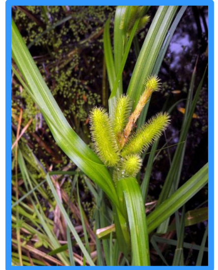
Bottlebrush sedge ( Carex comosa )