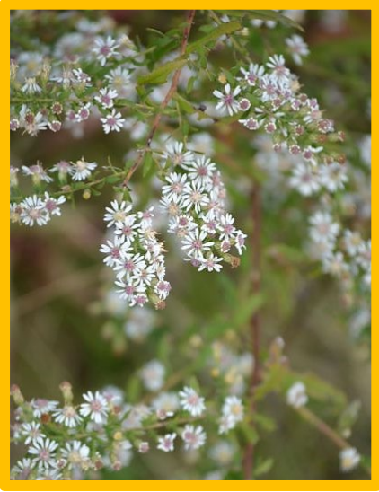
Calico aster ( Symphyotricum lateriflorum )