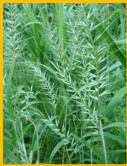
Bottlebrush grass ( Elymus hystrix )