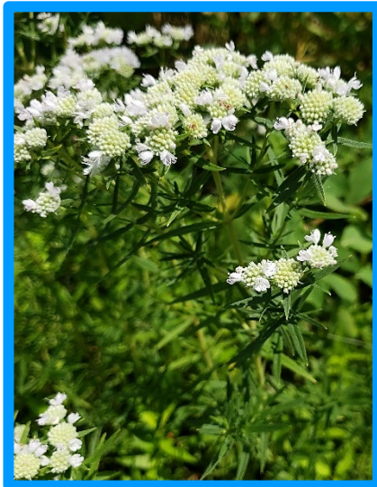
Mountain mint ( Pycnanthemum virginianum )