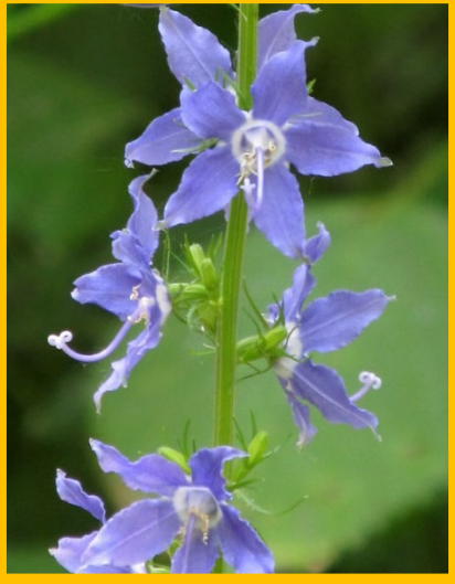
Tall bellflower ( Campanula americana )

Both beautiful and bountiful, this pack of plants is perfect for partial shade.