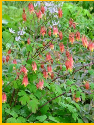
Columbine ( Aquilegia canadensis )