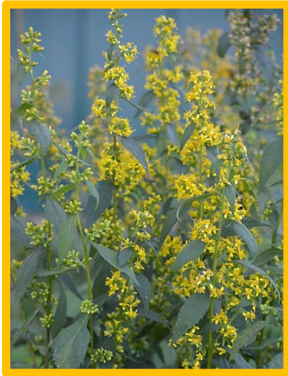
Zig zag goldenrod ( Solidago flexicalus )