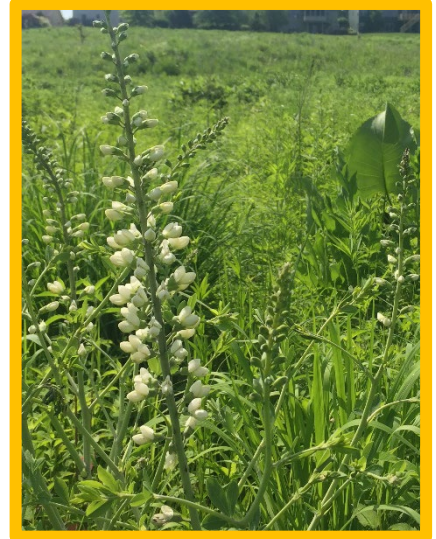
Wild white indigo ( Baptisia alba )