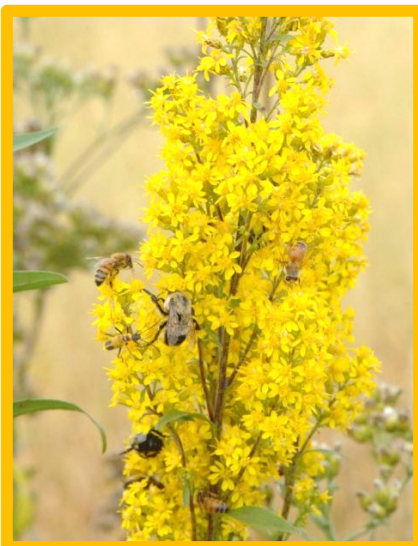
Showy goldenrod ( Solidago speciosa )