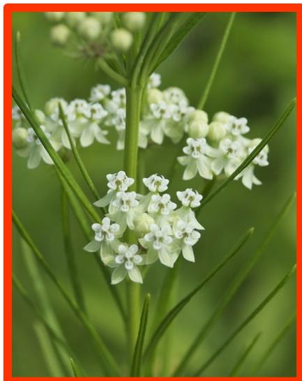
Whorled milkweed ( Asclepias verticillata )