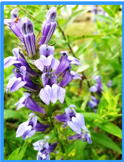
Great blue lobelia ( Lobelia siphilitica )