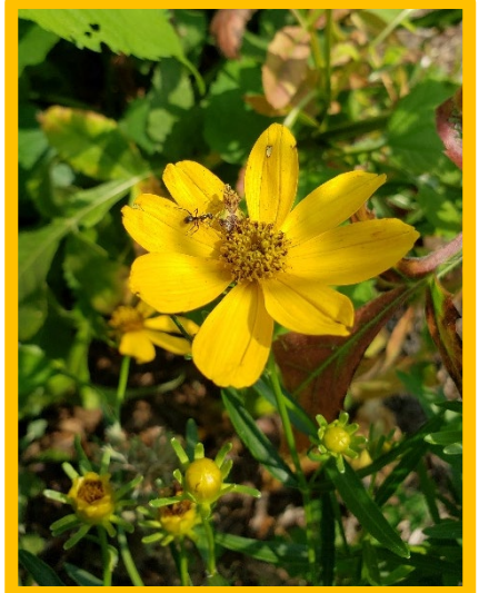
Prairie tickseed ( Coreopsis palmata )