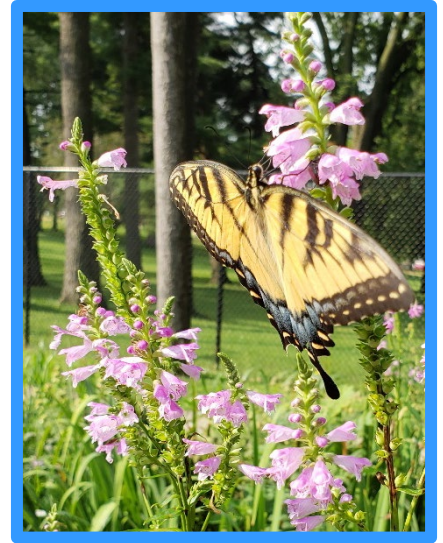
Obedient plant ( Physostegia virginiana )