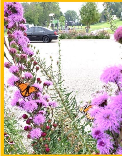
Meadow blazing star ( Liatris ligulistylis )