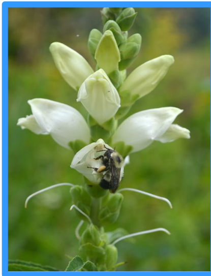
Turtlehead ( Chelone glabra )