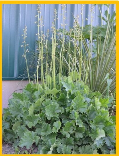
Prairie alumroot ( Heuchera richardsonii )