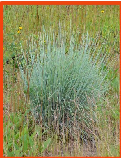
Little bluestem ( Schizachyrium scoparium )