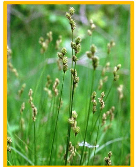
Bebb's oval sedge ( Carex bebbii )