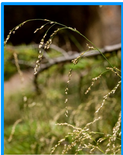
Fowl manna grass ( Glyceria striata )