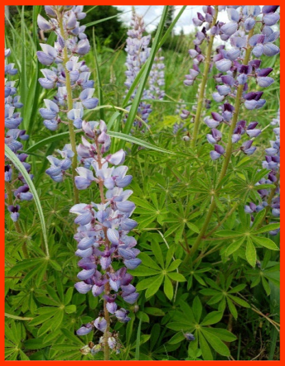
Lupine ( Lupinus perennis )

A beacon to bees and butterflies, this planting is what pollinator's all are buzzing about.