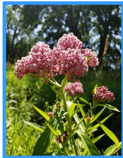
Swamp milkweed ( Asclepias incarnata )