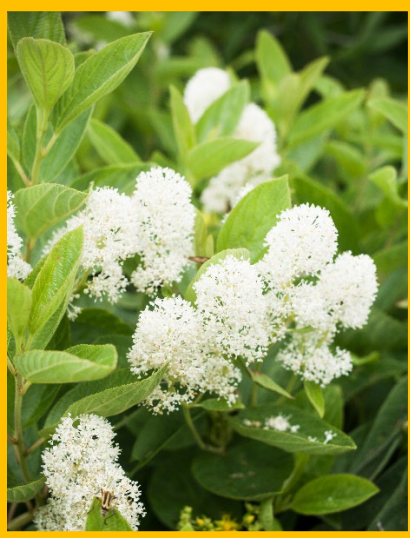
New Jersey tea (Ceanothus americanus)