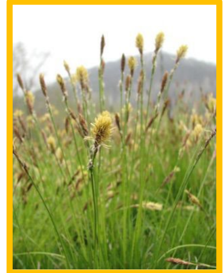
Common oak sedge (Carex pennsylvanica)