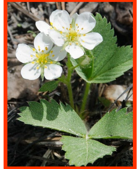
Wild strawberry (Fragaria virginiana)