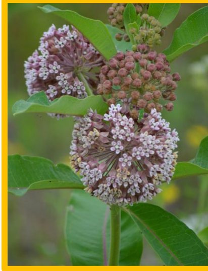
Common milkweed (Asclepias syriaca)