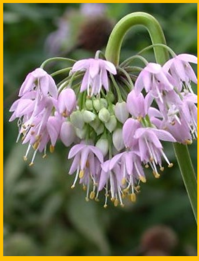
Nodding onion (Allium cernuum)

A simple, short-statured selection that doesn't sweat a little shade.