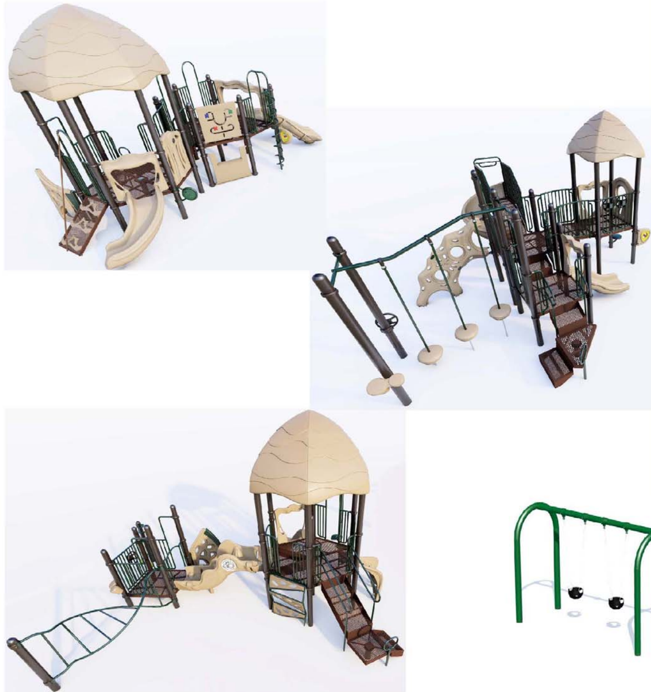
Company: Park and Play Structures