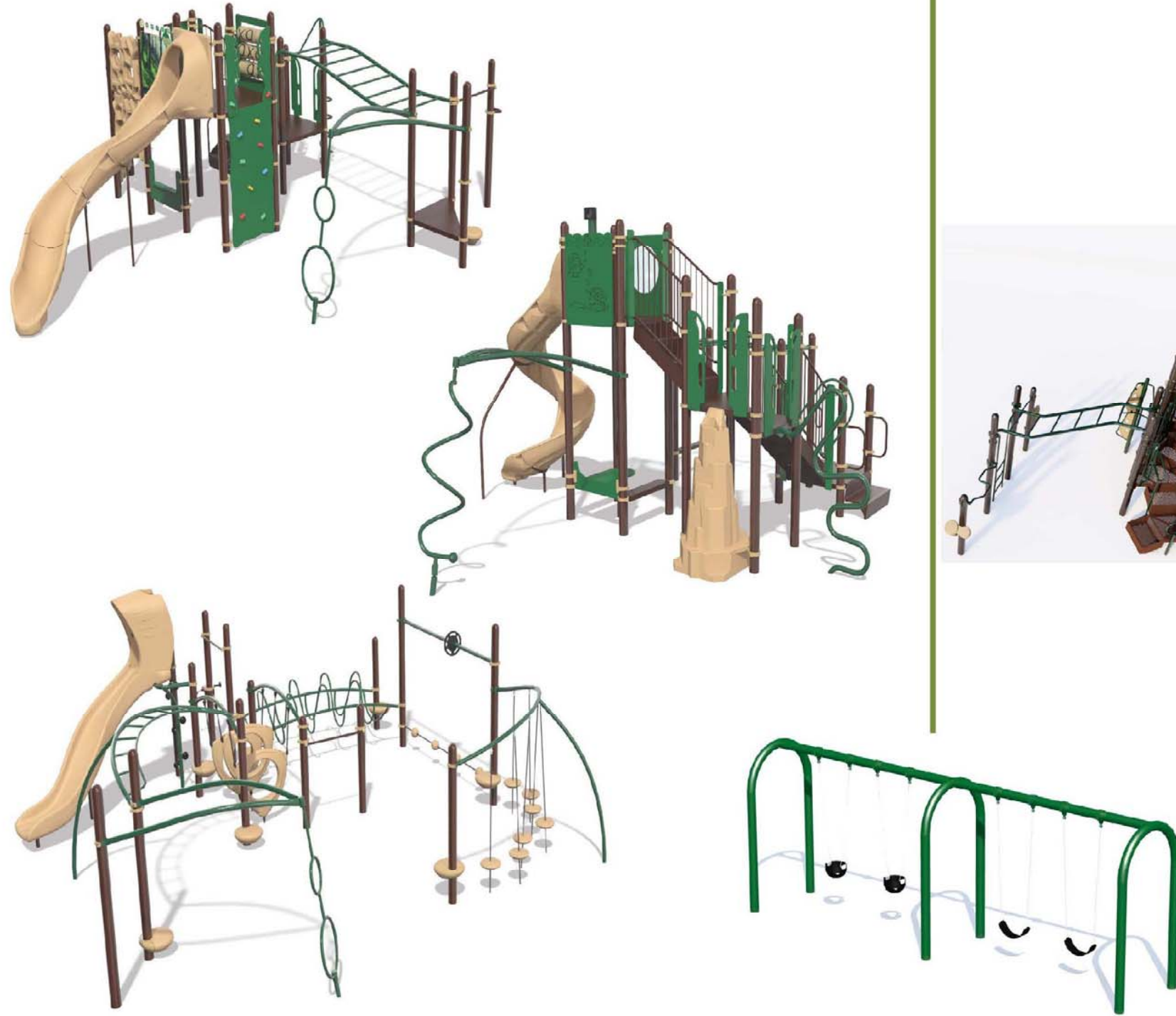
Company: Landscape Structures