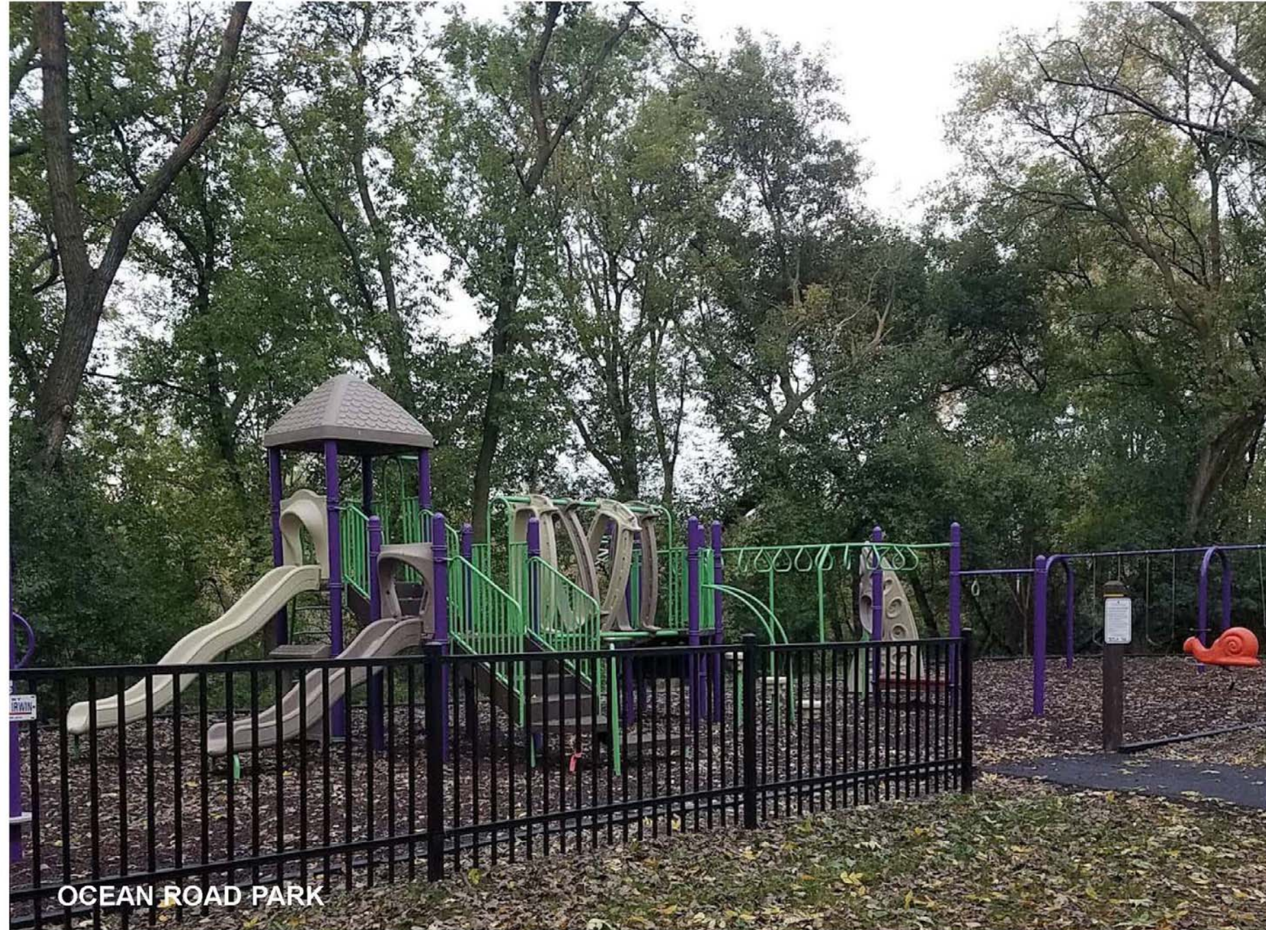
OCEAN ROAD PARK